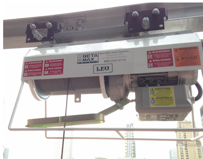
I-BEAM TROLLEY TOP