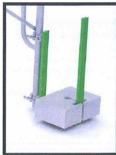
COUNTERWEIGHT CLAMP ASSEMBLY

Contact Beta Max today for local dealer information, to discuss your project, or get a quote. www.BetamaxHoist.com (800) 644-6478